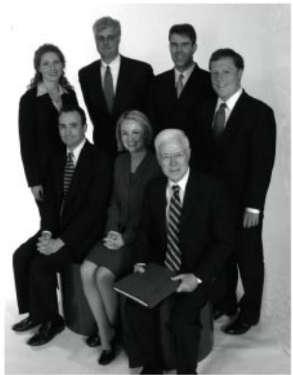
MUNICIPAL AND PUBLIC FINANCE GROUP